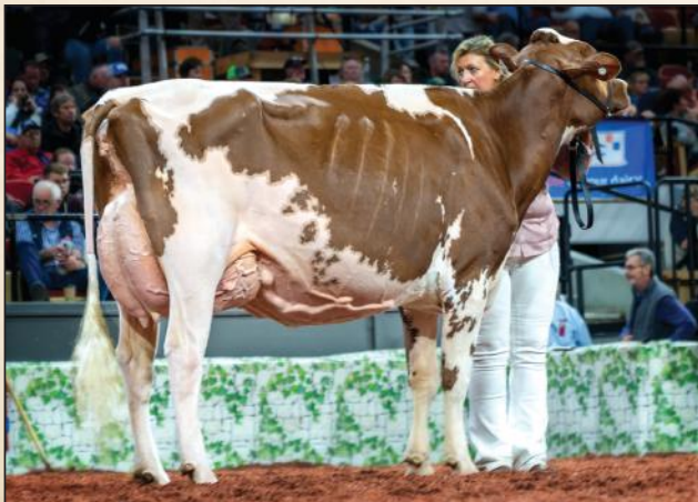
DAUGHTER: MS TRIPLE-T-TL FAME-RED 1st Jr 3 Yr-Old & Res. Intermediate Champion Royal 2023 1st Jr 3 Yr-Old & HM Intermediate Champion World Dairy Expo 2023 Owned by Oakfield Corners Dairy, NY