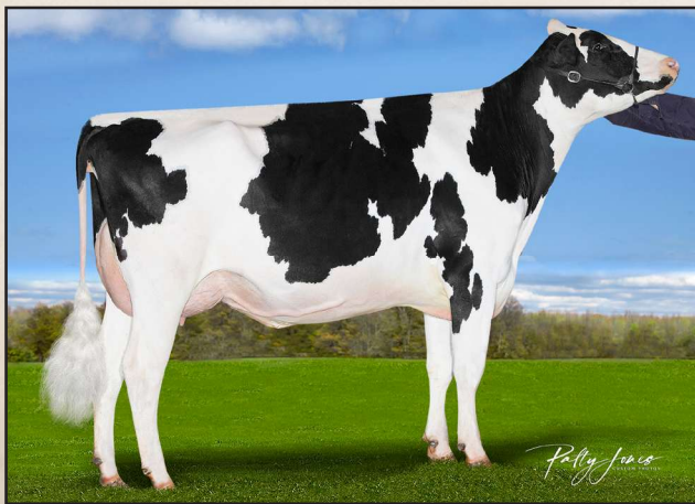
DAM - SILVERCAP LUSTER STILLNESS PP VG-86-3YR