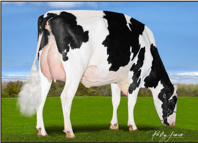
DAM - SILVERCAP LUSTER STILLNESS PP VG-86-3YR

4TH - 14TH DAMS VG-88 7* X VG 6* X VG-87 4* X GEN-I-BEQ GOLDWYN SECRETLY VG-87 21* X VG-87 8* X GLEN DRUMMOND SPLENDOR VG-86 39* X VG-88 18* X EX 14* X EX-2E 7* X VG 4* X VG