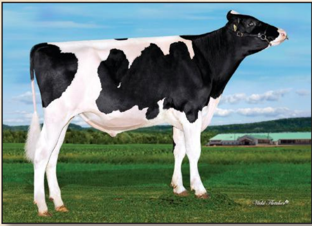
Pris XX 620

Reg: HOCANM14546059 / DOB: 10/4/2022 / ET BW A2A2 AB CDF CVF RDF VRF BYF BLF DPF CNF / aAa 243165