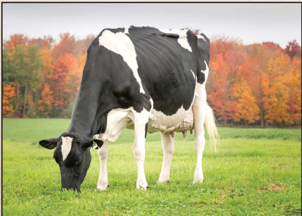
BELFAST GOLWYN LASENZA EX-95-3E 31*

4TH - 9TH DAMS VG-88-3YR 8* X BELFAST GOLWYN LASENZA EX-95-3E 31* X EX-92-6YR 5* X EX-91-2E 2* X EX-94-5E 6* X VG-86-6YR 1*