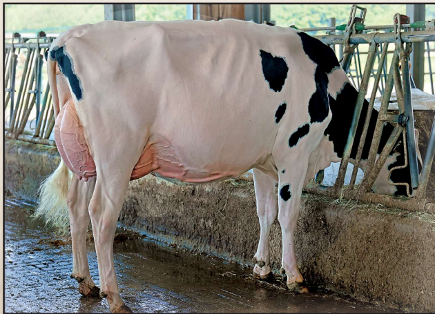
DAM - BLONDIN ALLIGATOR DARLING VG-88 3YR