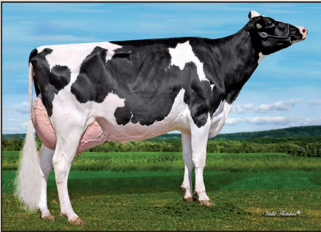
2ND DAM - WISSELVIEW LAMBDA DELIGHT EX 3*

4TH - 12TH DAMS VG-2YR 8* X EX 7* X VG-88 X EX-93-2E X EX-93-2E X VG-87 X EX-91 X SNOW-N DENISES DELLIA EX-95-2E 5* X EX-2E