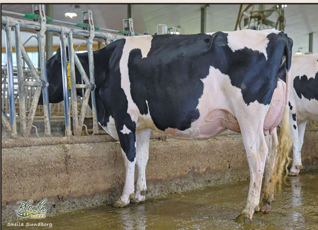
DAUGHTER MONTBRIANT AVENGER ROSELINE VG-87-2YR 1st Sr 2-Yr & H.M Intermediate Champion Lachute 2024 Bred by Ferme Beaudry & Fils and owned by Ferme Blondin