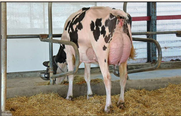
DAUGHTER FAMIPAGE AVENGER MUSCADE VG-89-3YR Bred and owned by Ferme Famipage

4TH - 13TH DAMS VG-88 15* X EX-2E 15* X VG-88-2YR 4* X EX-94-3E 13* X EX-6E 14* X VG-87 4* X VG-86 X EX 19* X VG-88 10* X EX