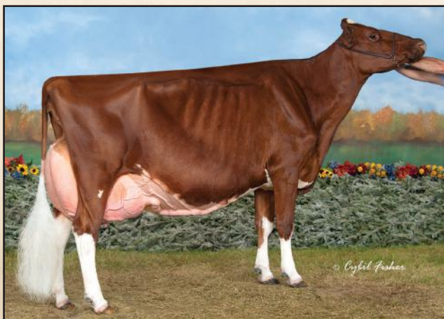
3RD DAM - KHW REGIMENT APPLE-RED EX-96-4E 41*