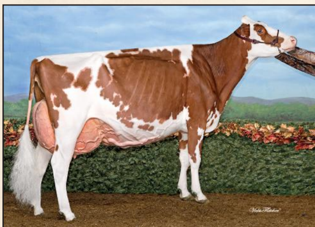
2ND DAM - MISS APPLE SNAPPLE RED EX-96-2E 3*

4TH - 9TH DAMS EX-95-2E 2* DOM X EX-93-3E DOM X EX-94-4E DOM X EX-96-4E DOM X EX-90-2E EX-90-3E