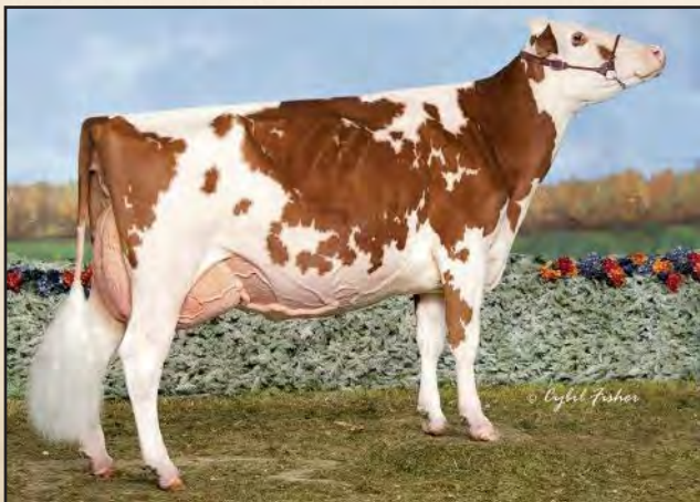
LOCHDALE SHAQUILLE MISSY EX-93-2E 3rd Dam