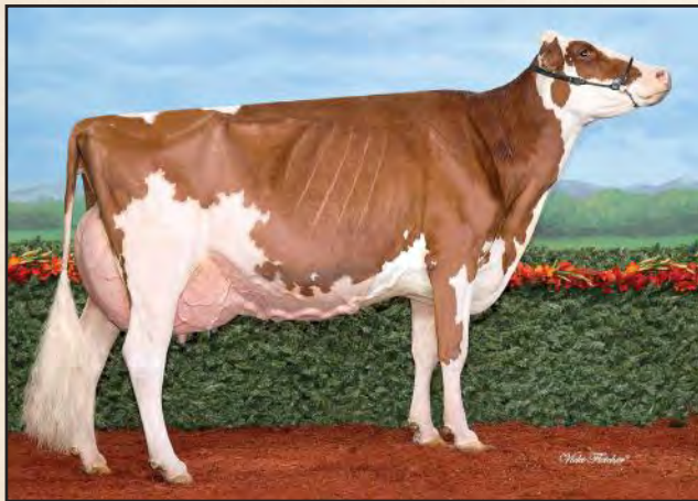
KAWARTHA ARMANI MEMORY EX-92 2nd Dam