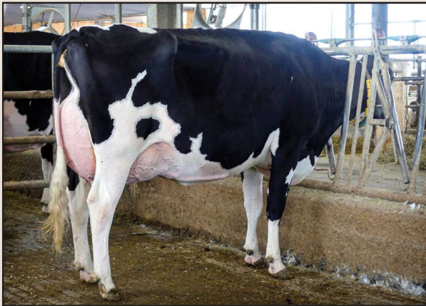
COMESTAR LATINE PERFECT VG-89-3YR 2nd Dam

4TH - 13TH DAMS VG-88-3YR 2* X COMESTAR LAMADONA DOORMAN EX-94-2E 34* X VG-87-2YR 20* X VG-88-3YR 22* X COMESTAR LAUTAMIE TITANIC VG-89-2YR 33* X VG-89-4YR 21* X VG-85-2YR 2* X VG-87-6YR 23* X COMESTAR LAURIE SHEIK VG-88-5YR 23* X EX-90 15*