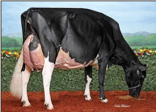
COMESTAR LAMADONA DOORMAN-EX-94-2E-34* 5th Dam