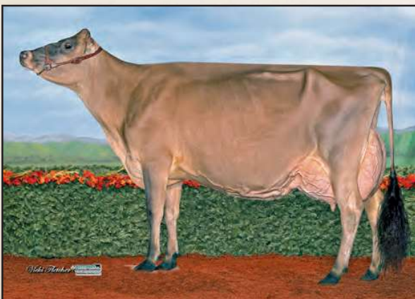
DAM UNIQUE MAGISTRATE GOLD-EX-94-4YR