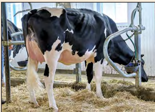
DAUGHTER AXEL AVENGER EMIKA-VG-2YR Owned by Axel Holstein, Quebec, Canada

4TH - 13TH DAMS VG-88 14* X EX-2E 12* X VG-88-2YR 4* X EX-94-3E 13* X EX-6E 14* X VG-87 4* X VG-86 X EX 19* X VG-88 10* X EX