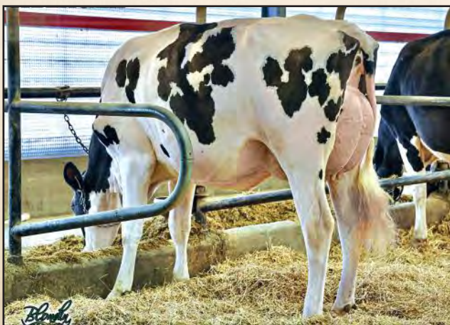
DAUGHTER FAMIPAGE AVENGER MUSCADE-VG-86-2YR Owned by Ferme Famipage, Quebec, Canada